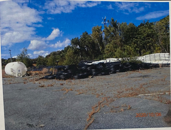
Description Photo at site showing tank and pipe.