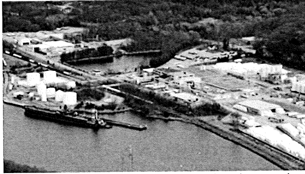
Image of site circa 2000 in full latex/styrene manufacturing operational status